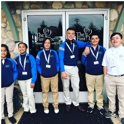
Left: FCF participants attending the Family Fun Zone on September 29th. Right: FCF Standard Bearers for the PURE Insurance Championship.